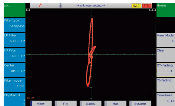
XY display during crack detection